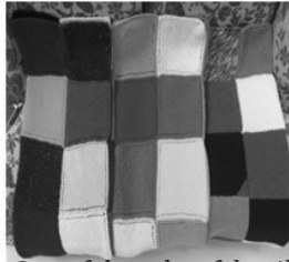
One of the colourful quilts